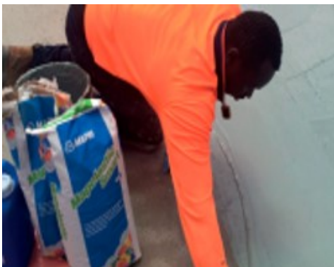
Installing Mapelastic Smart in the 50 metre pool at the Adelaide Aquatic Centre

ANY ALTERATION TO THE WORDING OR REQUIREMENTS CONTAINED OR DERIVED FROM THIS TDS EXCLUDES THE RESPONSIBILITY OF MAPEI.