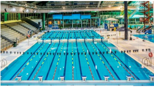
Completed 50 m pool at the Adelaide Aquatic Centre