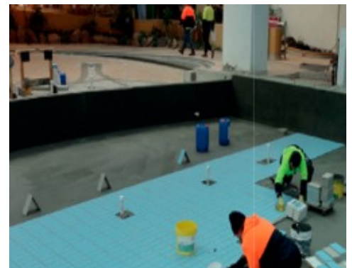
Installing pool tiles over Mapelastic Smart waterproofing membrane