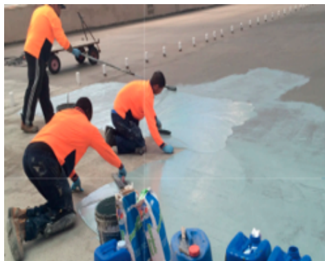
Installing pool tiles over Mapelastic Smart waterproofing membrane