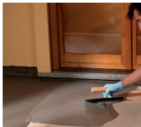
Waterproofing of terraces by trowel