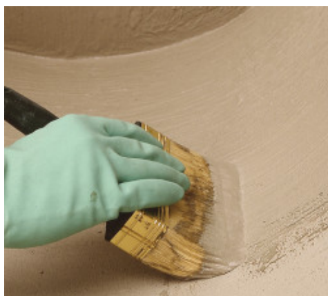
Waterproofing of details by brush