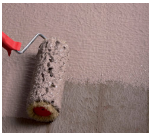
Waterproofing of details by roller